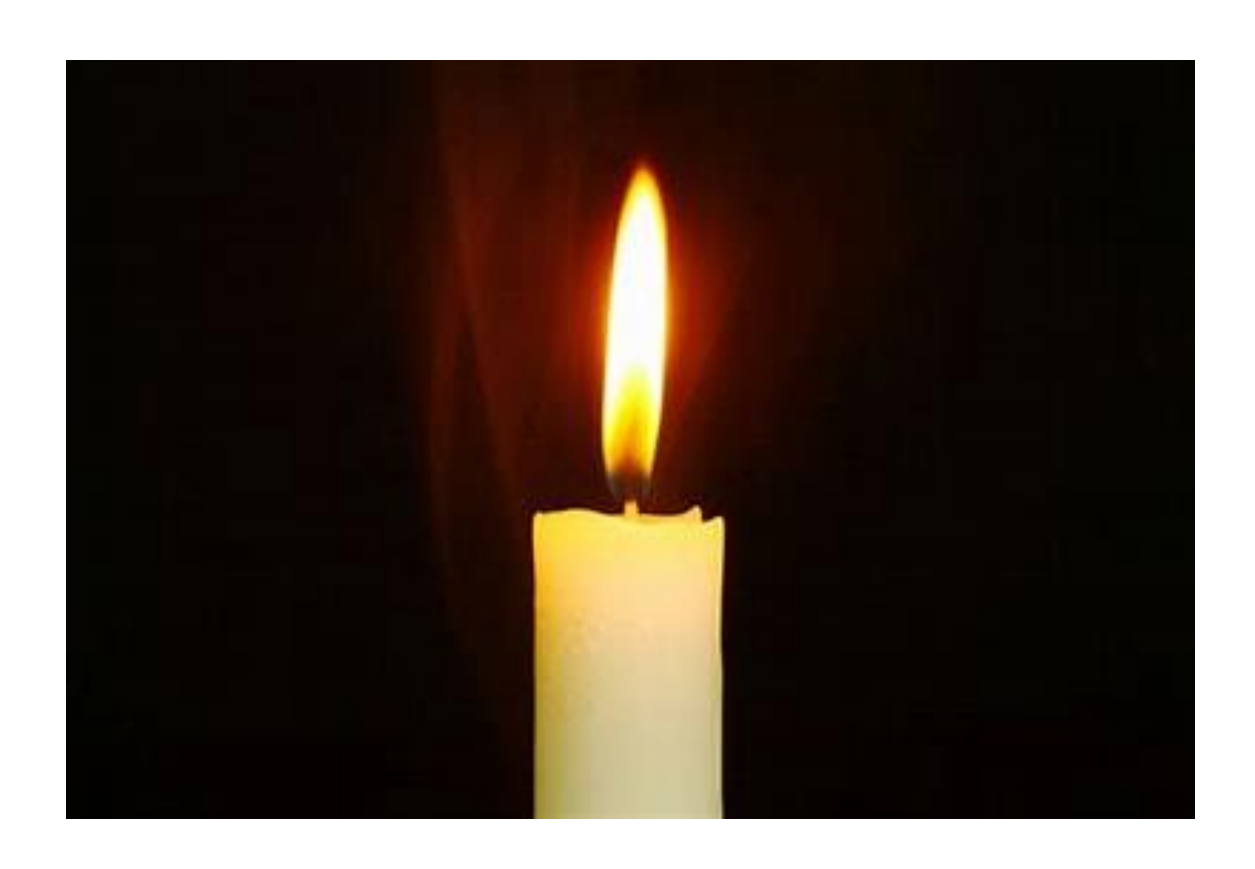
From Darkness to Light

Advent Sunday (28<sup>th</sup> November), 2021 6:30 p.m.