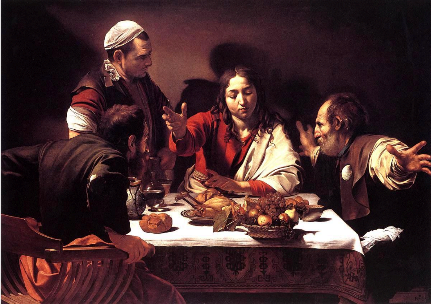
The Supper at Emmaus, (Michelangelo Merisi da) Caravaggio, 1601 National Gallery, London