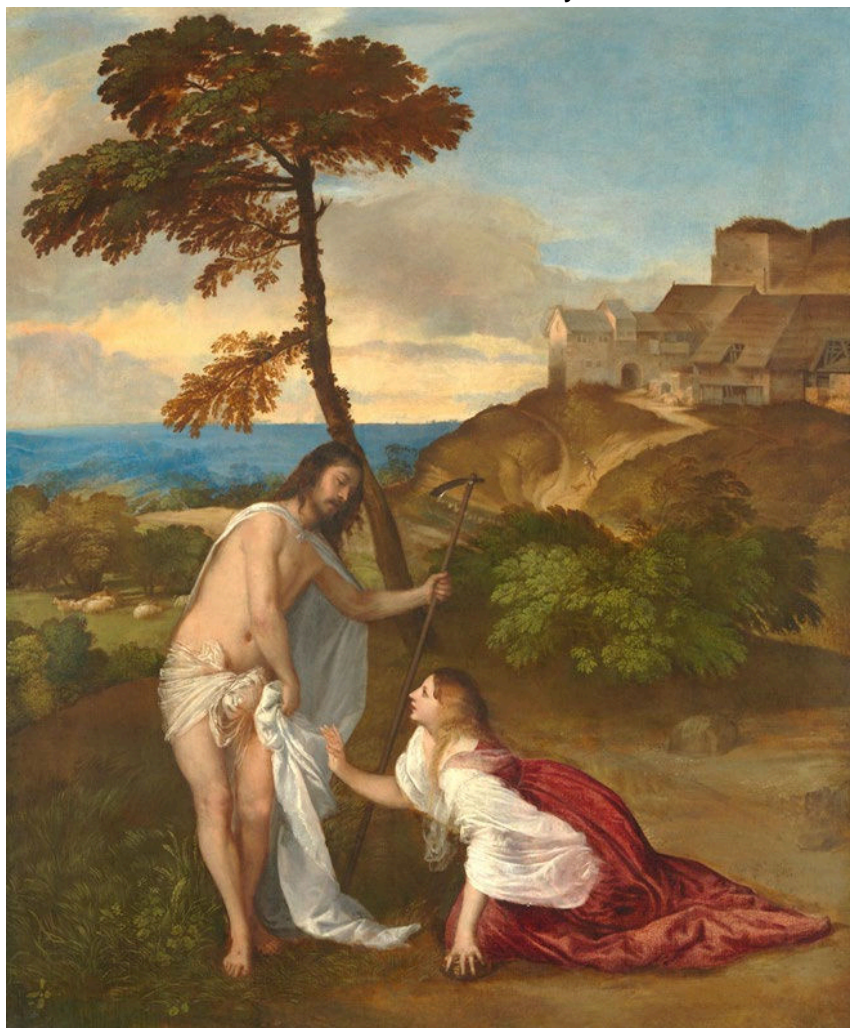
Noli me tangere by Titian National Gallery, London